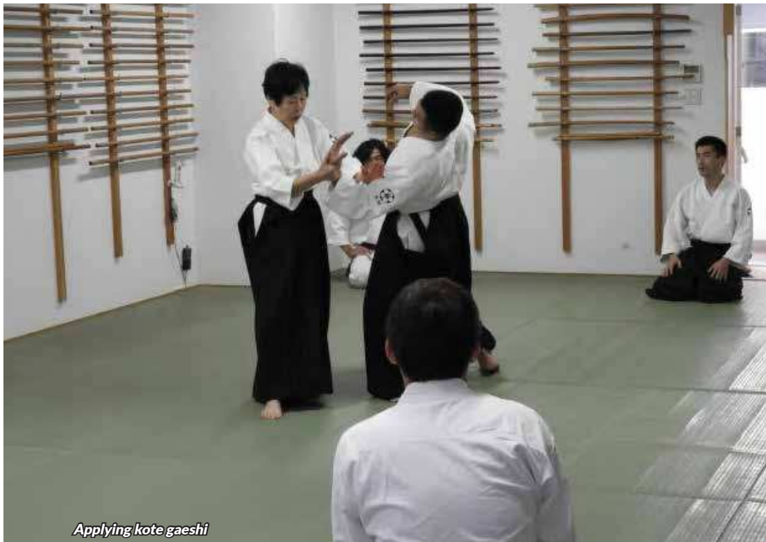
Applying kote gaeshi