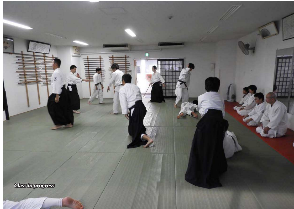
Class in progress

- MF: Thanks to you both for coming all the way from Tokyo to see me and my dojo.