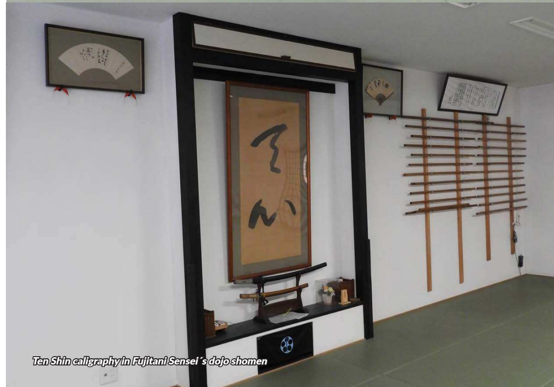
Ten Shin calligraphy in Fujitani Sensei's dojo shomen