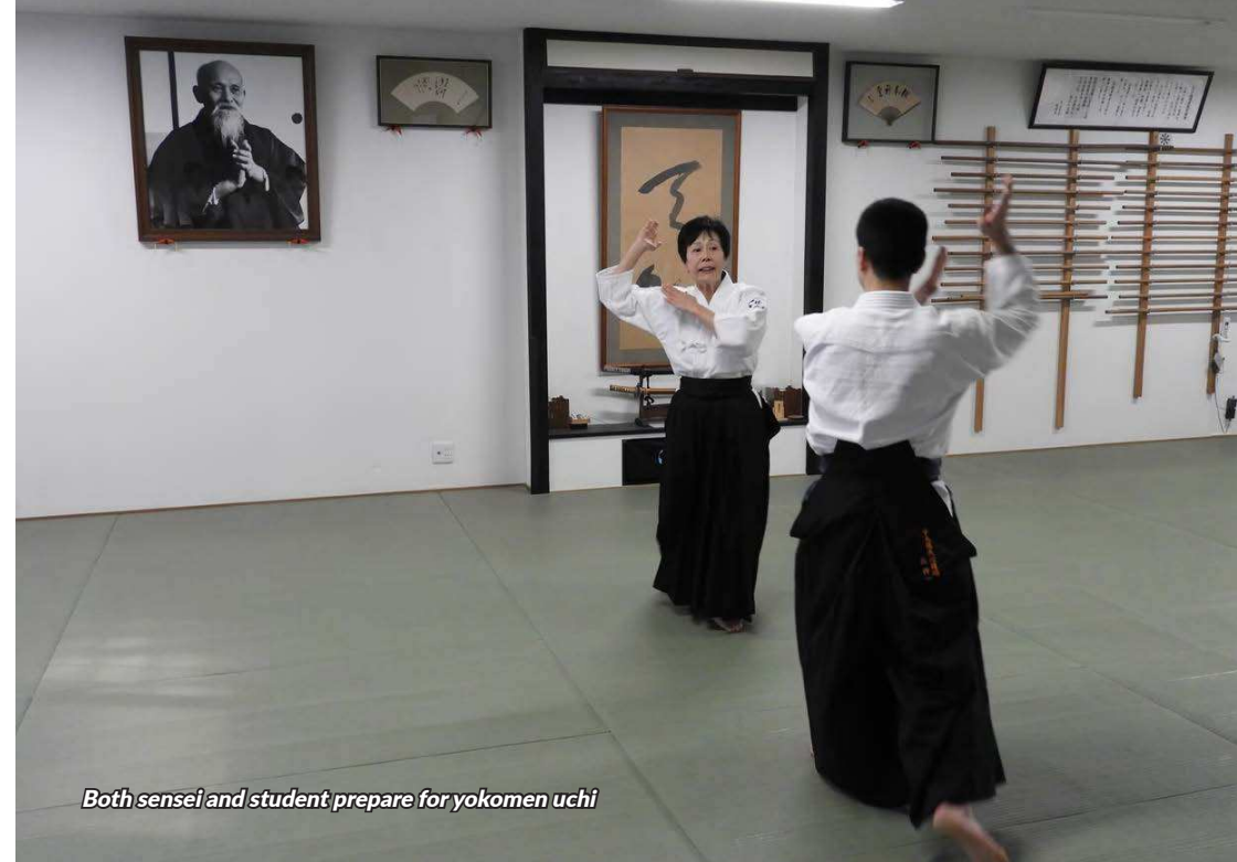
Both sensei and student prepare for yokomen uchi

- MF: Yes, they grew up here although they live in Los Angeles now.