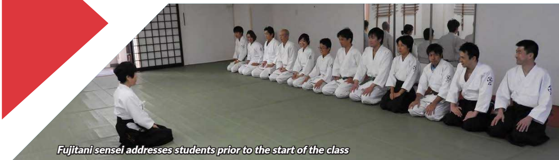
Fujitani sensei addresses students prior to the start of the class