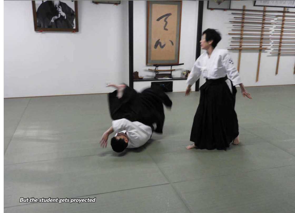
But the student gets projected