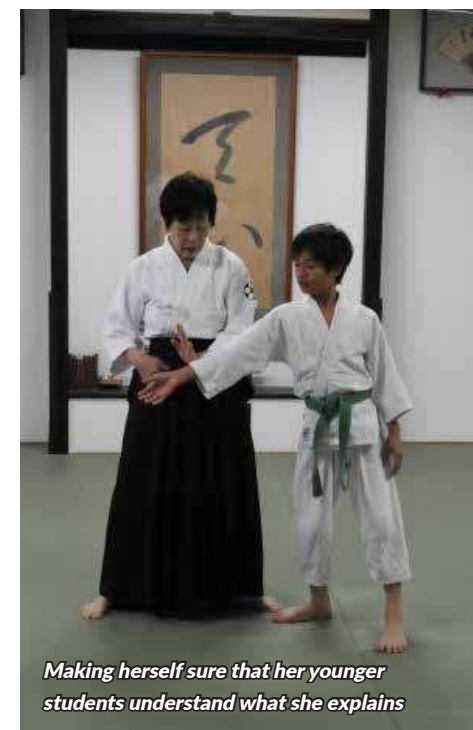
Making herself sure that her younger students understand what she explains