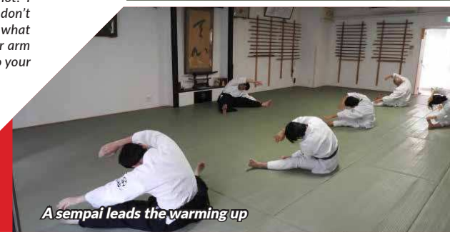
A sempai leads the warming up