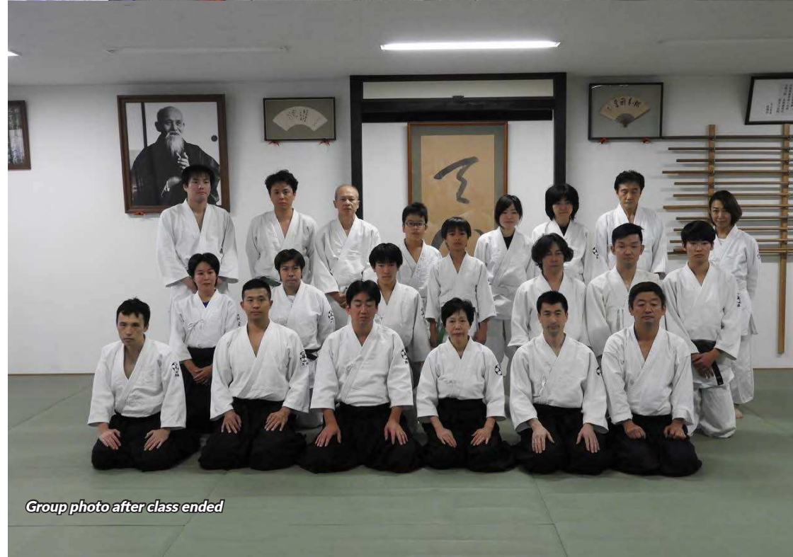
Group photo after class ended